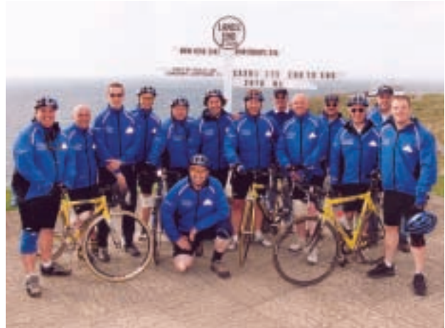
John O'Groats to Lands end sponsored bike ride team from Carlisle site

We are confident that this will help our employees do even more for the schools and charities that they want to support.